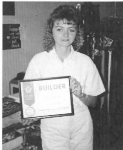
The Jean Shop