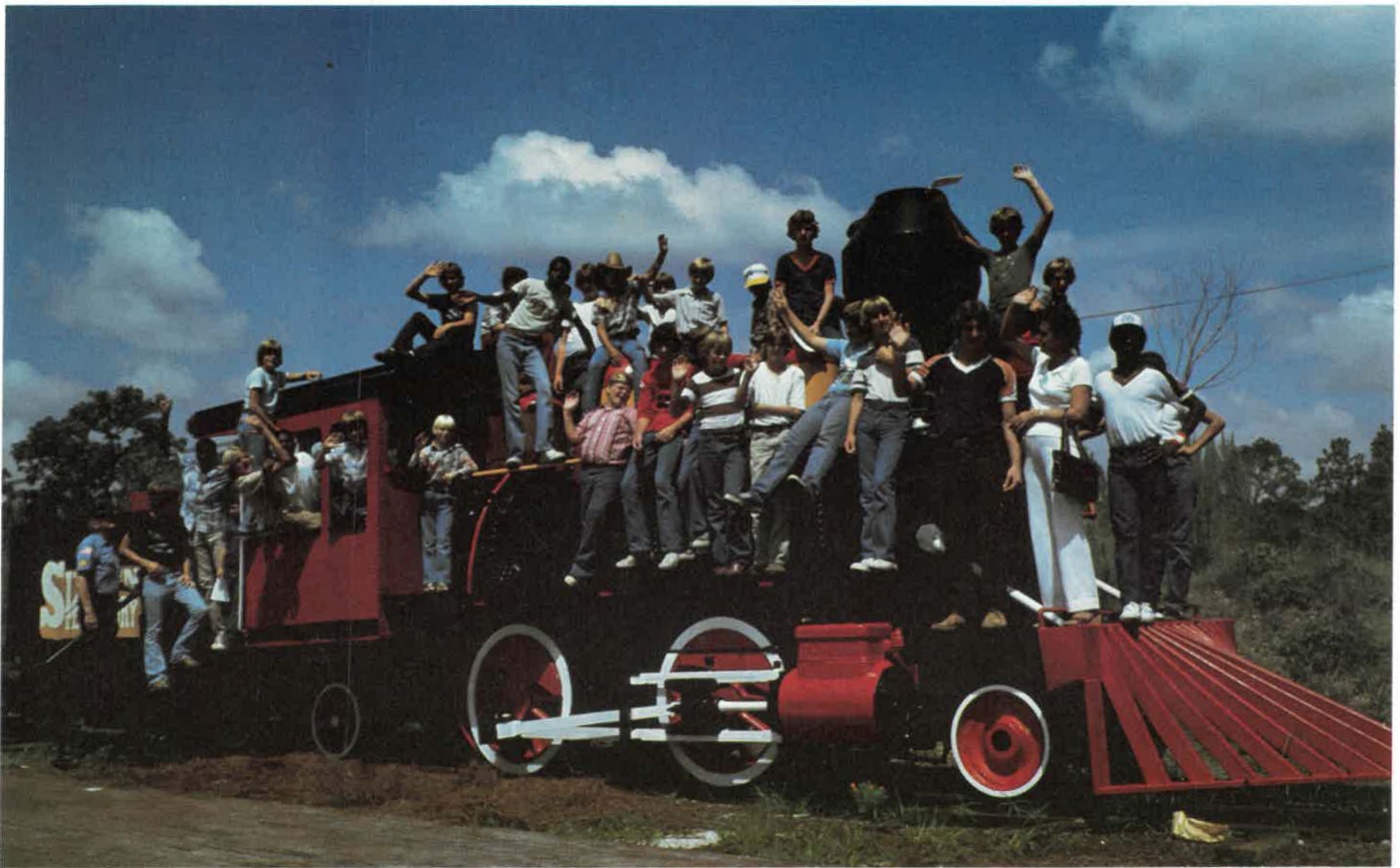
All aboard for a day of fun at Six Gun Territory!