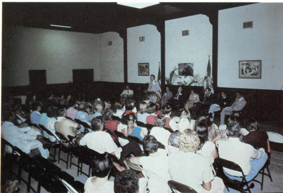
Dedication rites were held in the spacious recreation room.