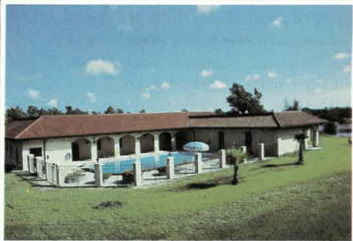
Rear view of the activity center with the swimming pool in the foreground.