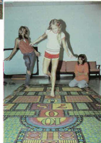
The ancient game of hopscotch is alive and well.