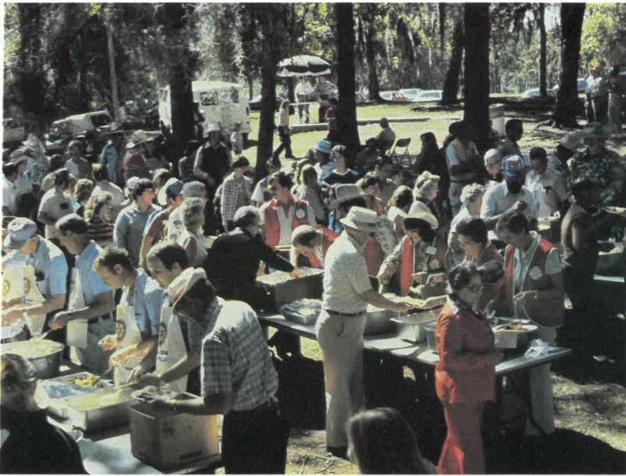
Some 1,900 people went through four serving lines at the fish fry on the banks of the Suwannee River.