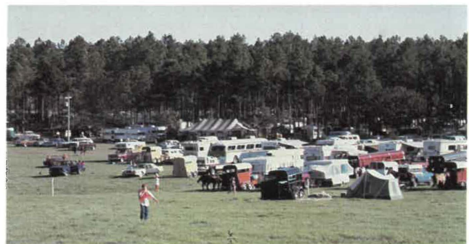
This picture shows just a small part of the camping area at the horse show arena where visitors in record numbers camped overnight.