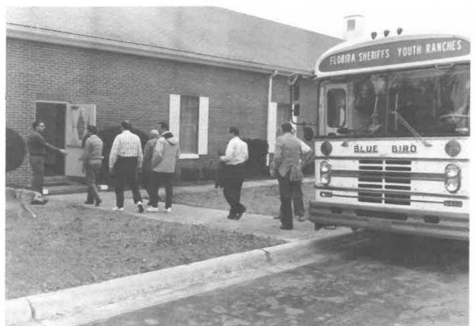
Sheriffs-Elect arriving at the Boys Ranch cafeteria.

Afterward the visitors returned to Tallahassee well prepared to become future fund raisers and "friend raisers" for the Florida Sheriffs Youth Ranches, Inc., an agency that depends almost entirely upon voluntary contributions for its financing.