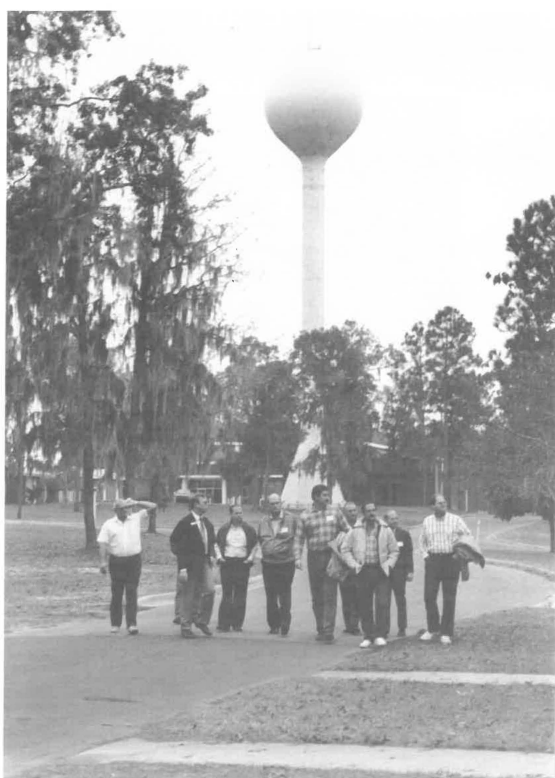
Sheriffs-Elect were given a walking tour of the Boys Ranch facilities.