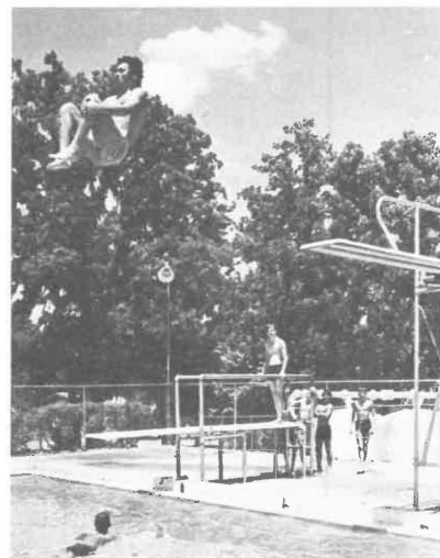
Since the program did not include the usual banquet and business meeting, there was more time for fun in the sun.