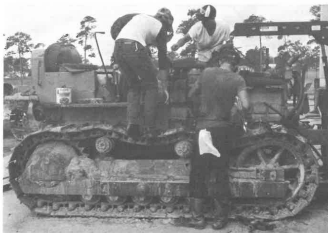
Students removing the motor from the bulldozer.