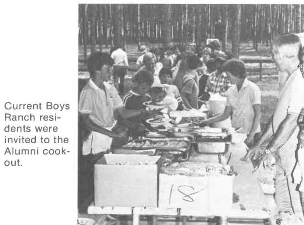
Current Boys Ranch residents were invited to the Alumni cookout.