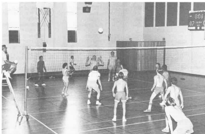
The alumni team (far court) won the annual Alumni vs. Ranchers volleyball game.