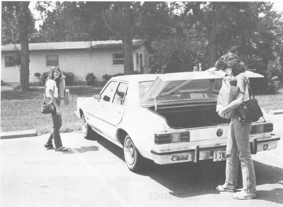
Using the Villa convenience car for shopping trips is a privilege that costs the girls ten cents a mile. The Independent Living cottage is in the background.