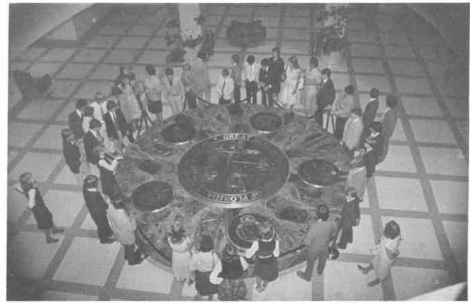
A pause at the center of Florida's political universe — the "great seal" in the rotunda of the capitol.