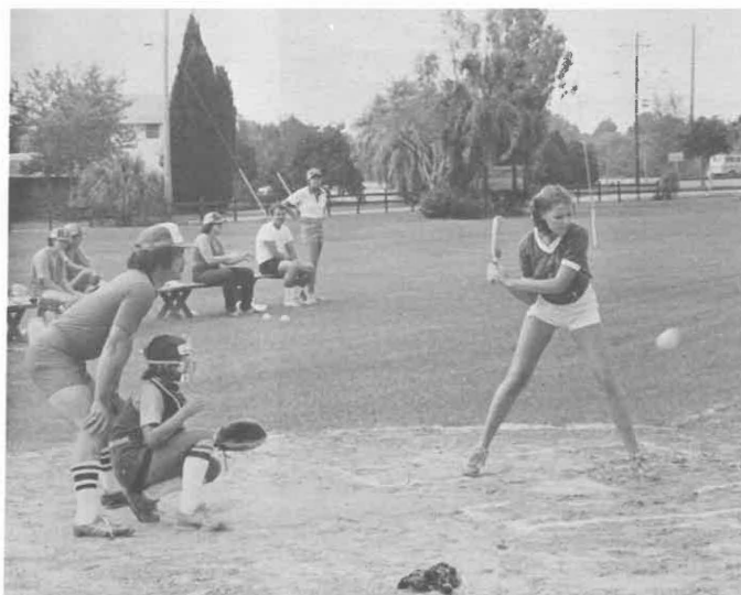
Our Girls Villa Angels played softball teams from nearby towns, and also challenged our female staff members.